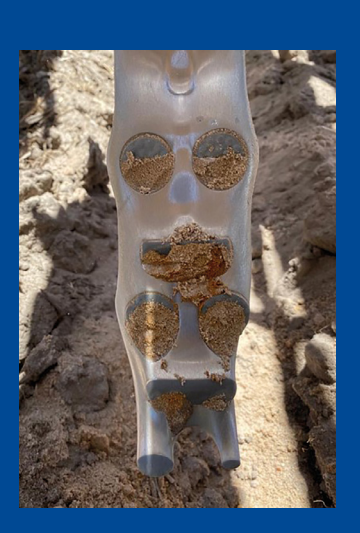
Excellent soil penetration throughout the whole tool life by always remaining at least one carbide tip.